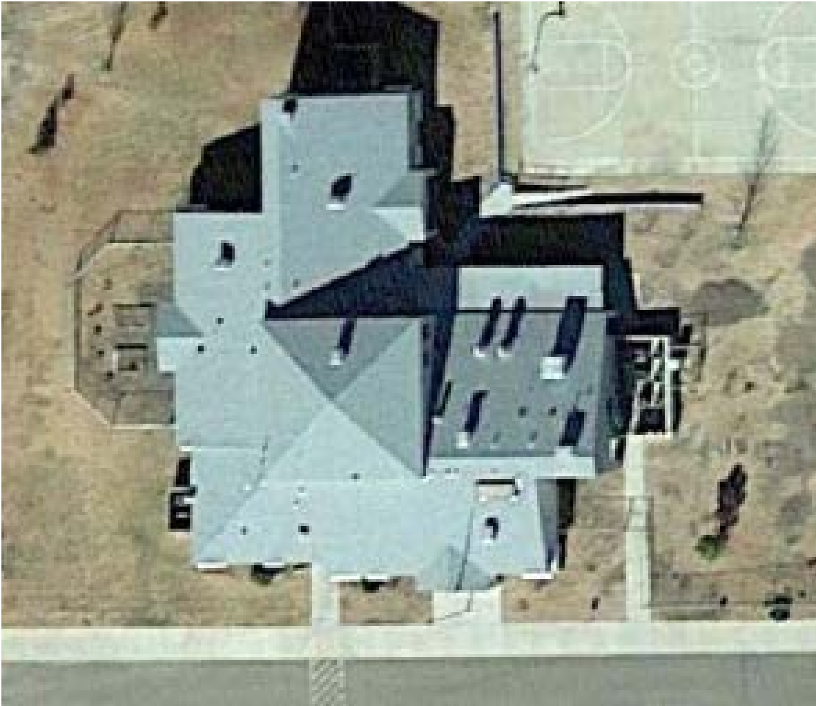
Site Map of Double Adobe Elementary School.